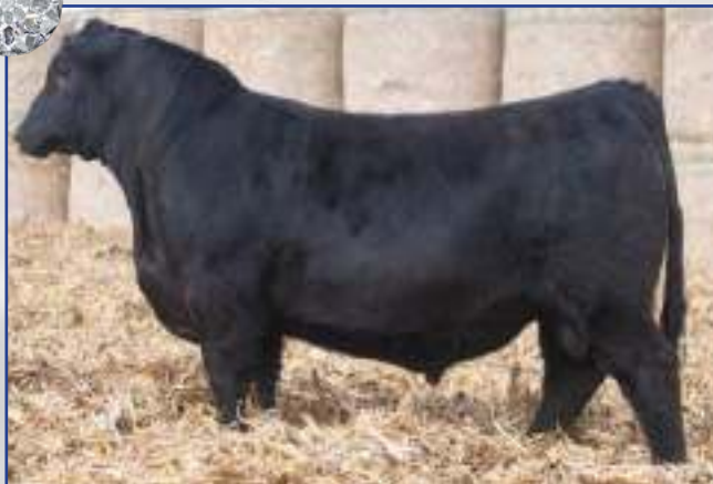
Service sire of lots 23, 26, 30, 32, 33, 38