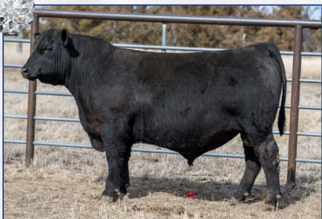
Service sire of lots 1, 22, 24, 34