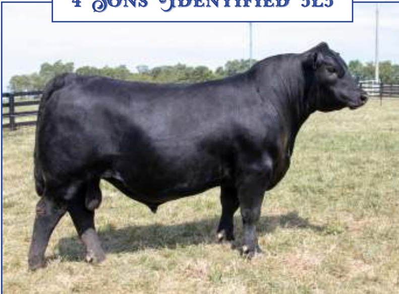
SIRE OF LOT 17A