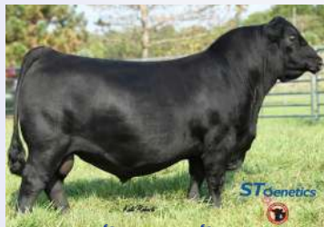
CONNEALY COMMERCE REG. #: 20132642

Don't miss this opportunity to add proven, high-quality females to your herd. For inquiries or to schedule a visit, contact Clay at 605-685-3311.