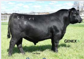
C & B WILDCAT 9402 REG. #: 19810163