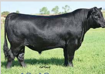
FHCC FOUNDATION 1558 REG. #: 20119569