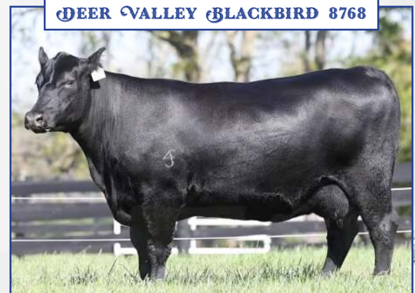
PATERNAL GRAND DAM OF LOT 17A

Schaack Rita 5135 is the perfect complement to Lot 17, offering a cow-calf package with donor-level potential. We were fortunate to acquire her sire, 4 Sons Identified 5L5 from Four Sons Farm, Cynthiana, KY, and her first calf—an October-born heifer—is already showing the balance, growth, and phenotype we expect from this mating.