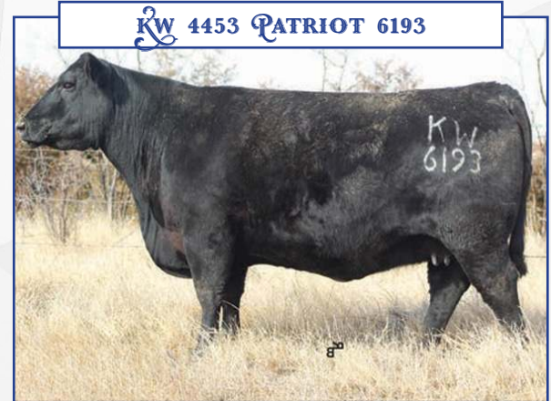
DAM OF LOT 17