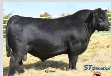
SCHAACK SATISFACTION REG. #: 19682617