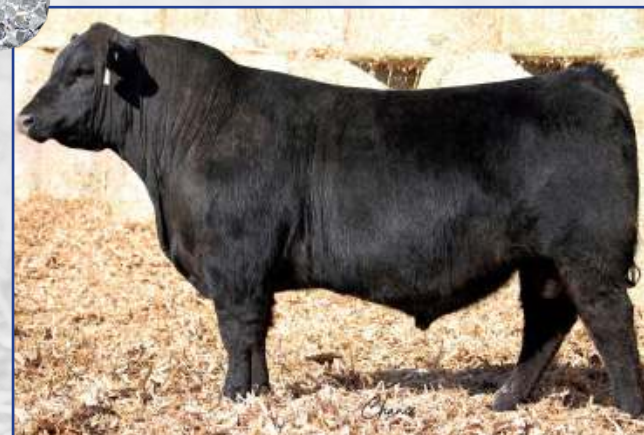
Service sire of lots 16, 28