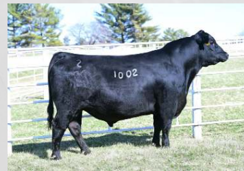
SCHAACK HOME RUN REG. #: 20224351