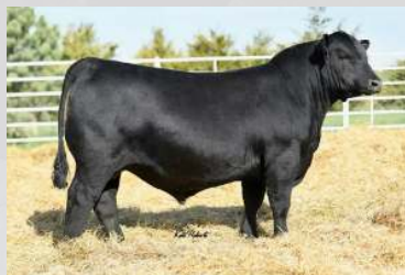
SCHAACK LOAD UP 0256 REG. #: 19982788